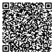
Tips on how you can support your child's educational journey

Parenting can be an exciting and enriching journey and as a parent, you play a key role in your child's growth together with the school. Our children do best when schools and parents work hand-in-hand, with mutual trust and respect. Through working hand-in-hand with schools, you will better understand the needs and development of your child, so that you may give him the necessary care, support and reinforcement at home. The QR code on the left provides some tips on how you can support your child's educational journey.