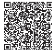
Professional Practice Guidelines

Check with your healthcare professional that he/she adheres to the Professional Practice Guidelines on psycho-educational assessment and placement which can be found here: https://go.gov.sg/professionalpractice