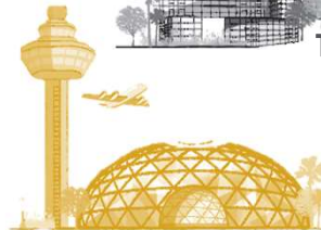
Jewel Changi Airport