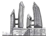
Reflections @ Keppel