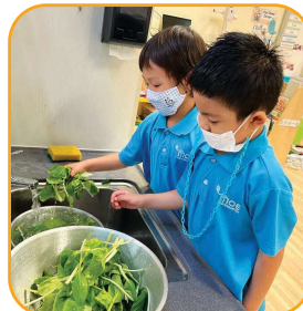
Children working in pairs to wash the bai cai that they harvest and prepare them for stir frying