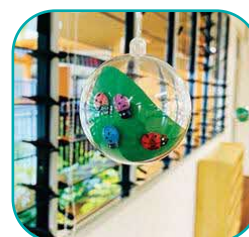
A transparent ball containing toy ladybugs to encourage children to count them and compare the different colours and patterns found on the ladybugs

Our bright and naturally-ventilated indoor spaces have an open design to create a welcoming environment for children to learn in and move about freely. Apart from the classrooms, we also tap shared spaces to stimulate the children's interest and thinking. This includes our indoor corridors which children use daily. We hang transparent balls containing different items for children to observe, count and compare as they walk past daily. Such intentional and flexible use of space and resources help to excite children's curiosity and reinforce learning such as numeracy concept and skills, enriching the MK's learning environment.