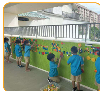
Children exploring and experimenting with building bricks in different ways at the Lego Wall