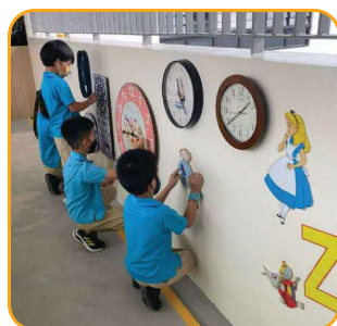
Children exploring how clocks work and the idea of time at the Clock Wall