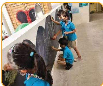
Children expressing themselves freely through doodling and drawing on the Chalk Wall

MOE Kindergarten @ Mayflower has transformed the spacious common corridors into interesting and engaging spaces to promote and support children's learning. The Chalk Wall, the Clock Wall and the Lego Wall are located along the common corridors and provide additional spaces for learning through purposeful play and quality interaction. A Word Wall has also been set up outside the children's toilet to actively engage them while they wait for their turn to use the toilet.