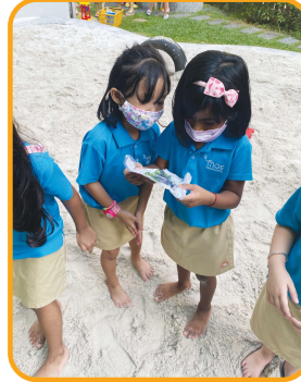
Children finding more clues after digging through the sandpit to piece together the setting of the story