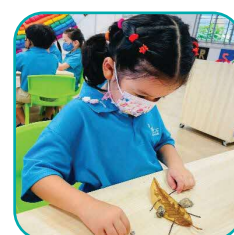
A child creating an imaginary insect using the materials collected from the walk around the MK