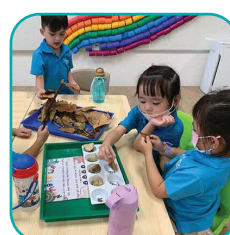
Children sorting and counting the materials they collect after a walk