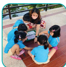
Teacher and children observing and discussing the features of pebbles found from their walk around the MK