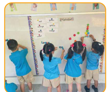
Children using magnetic letters to create their names or familiar words on the Word Wall