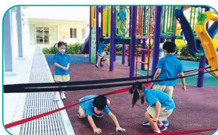
Children exploring different body movements to escape 'spiderwebs' created by long elastic bands at the playground