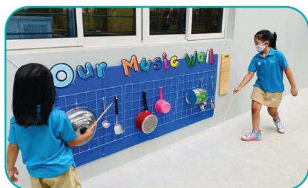
Children exploring sounds and enjoying creating music while hitting away at common household items on the outdoor music wall

In MK@Angsana, we strongly believe that every space is a learning space. Look at how our children enjoy music through the music wall along our outdoor walkways ! The children also enjoy outdoor play time with one another at the MK. The carefully selected and developmentally appropriate playground equipment offer different levels of challenges and encourage different types of movements such as climbing, crawling and balancing to help build children's gross motor skills. The purposefully designed sand and water play areas provide children with opportunities to engage in sensory, creative and imaginary play.