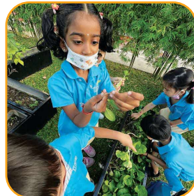
Children working in groups to harvest the vegetables from their garden as they learn about edible plants and parts of the bai cai

Our MK environment is, indeed, the third teacher of our children!