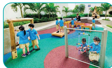
Children playing safely and happily as they get wet at the water play area