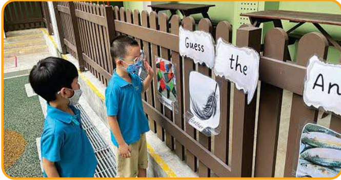
Children exploring the playground for picture clues to guess which animal is the main character of the story

When the teachers read the story to the children, they can then better relate to the story and compare their predicted plots to the actual story.