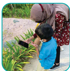
Teacher and child finding out what the plant is during their walk in the garden

Children get to innovate with open-ended materials and engage in cooperative play with their friends. When they go on walks around the MK, they get to learn in and about the outdoors as they observe flora and fauna around them in the landscape areas and gardens , and collect found materials for their loose parts play which fosters their creativity.