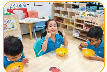
Children appreciating the benefits of eating vegetables as they enjoy the fruits of their labour