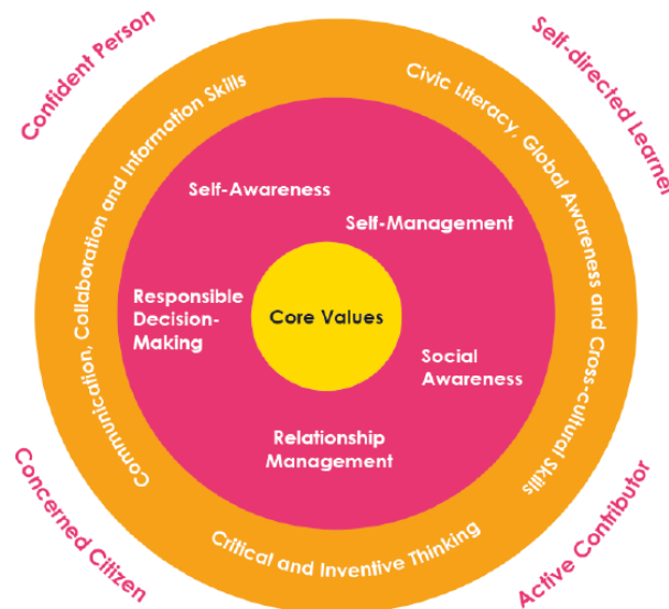
Figure 1.2: Framework for 21 st Century Competencies and Student Outcomes

To help students thrive in a fast-changing world and face challenges of the future, MOE has identified competencies that have become increasingly important in the 21 st century. Figure 1.2 shows the framework for 21 st Century Competencies (21CC) and Student Outcomes. This framework illustrates the holistic education to prepare students for the future.