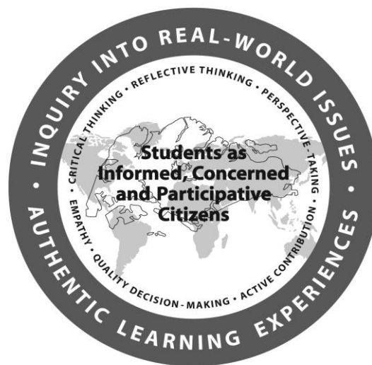
Figure 1.1: The Singapore Social Studies Curriculum

Figure 1.1 reflects the philosophy underpinning the Singapore Social Studies curriculum.