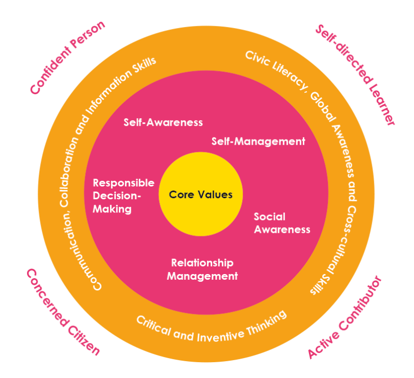
Fig. A2: Framework for 21CC and Student Outcomes

The Electronics curriculum supports students' development of important competencies necessary for them to thrive in the 21<sup>st</sup> century that are anchored in enduring values. The framework for the 21CC and student outcomes is presented in Fig. A2 .