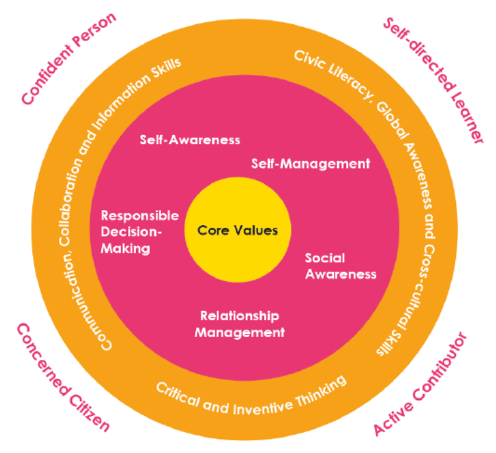
Figure 2: Framework for 21CC and Student Outcomes

The MOE 21CC framework (<u>Figure 2</u>) spells out the important competencies that students need to thrive in the 21<sup>st</sup> century. These competencies are anchored on a set of enduring values.