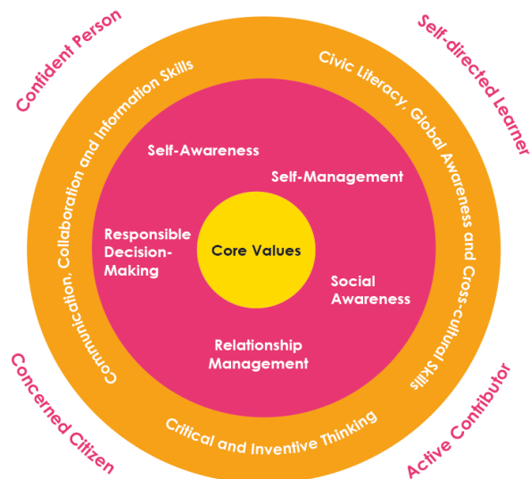
Figure 1.1 Framework for 21 st Century Competencies and Student Outcomes

Knowledge and skills must be underpinned by values. Values define a person’s character. They shape the beliefs, attitudes and actions of a person, and therefore form the core of the framework of 21st Century Competencies (21CC).