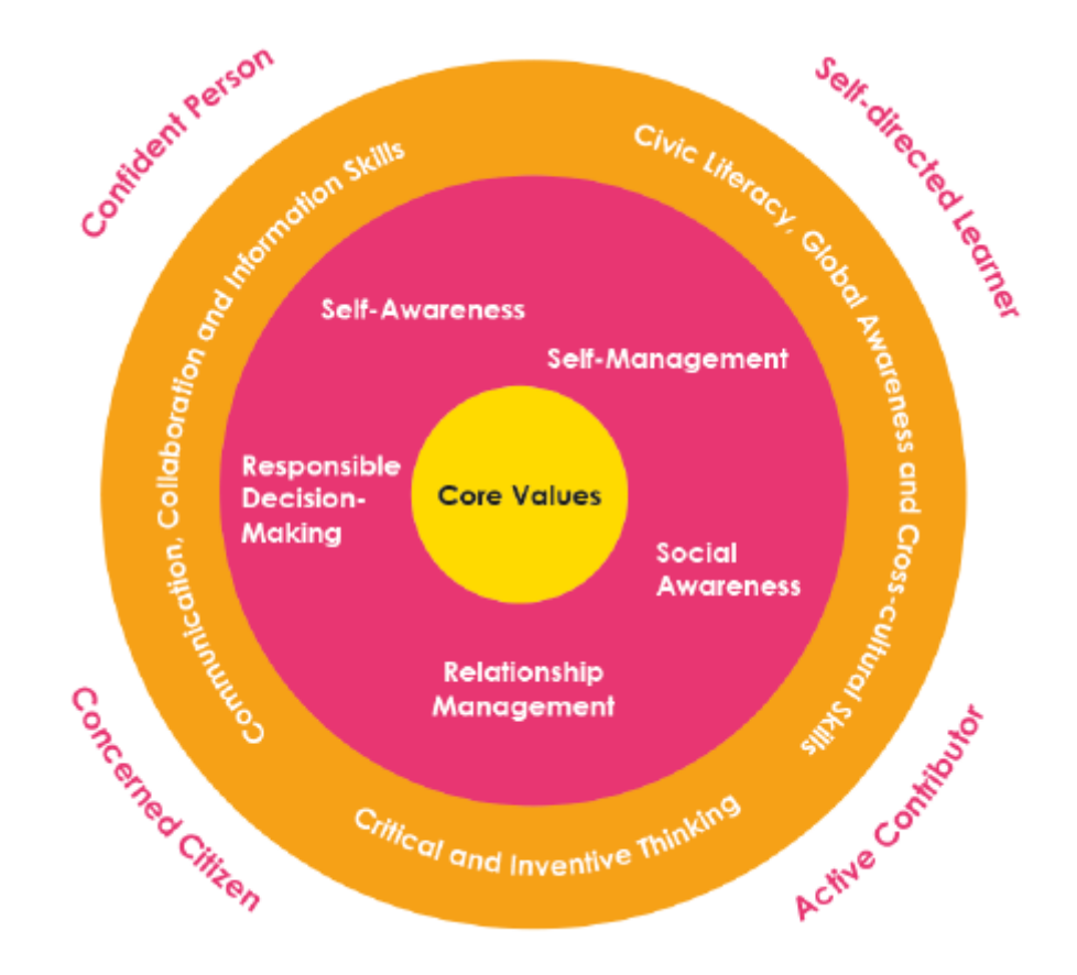
Figure 1.1: Framework for 21st Century Competencies and Student Outcomes

To prepare our students for the future, a Framework for 21st Century Competencies (21CC) and Student Outcomes was developed by MOE (see Figure 1.1 ). This 21CC framework is meant to equip students with the key competencies and mindsets to be successful in the 21st century, even as we maintain our strong fundamentals in teaching and learning.