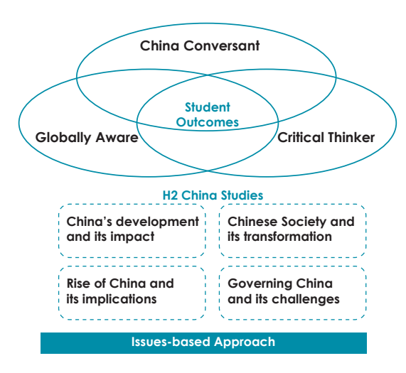
Figure 1: H2 China Studies in English Curriculum Shape

To achieve these aims, the syllabus has adopted an issues-based approach , which will focus on key developments and discourse with regard to contemporary China.