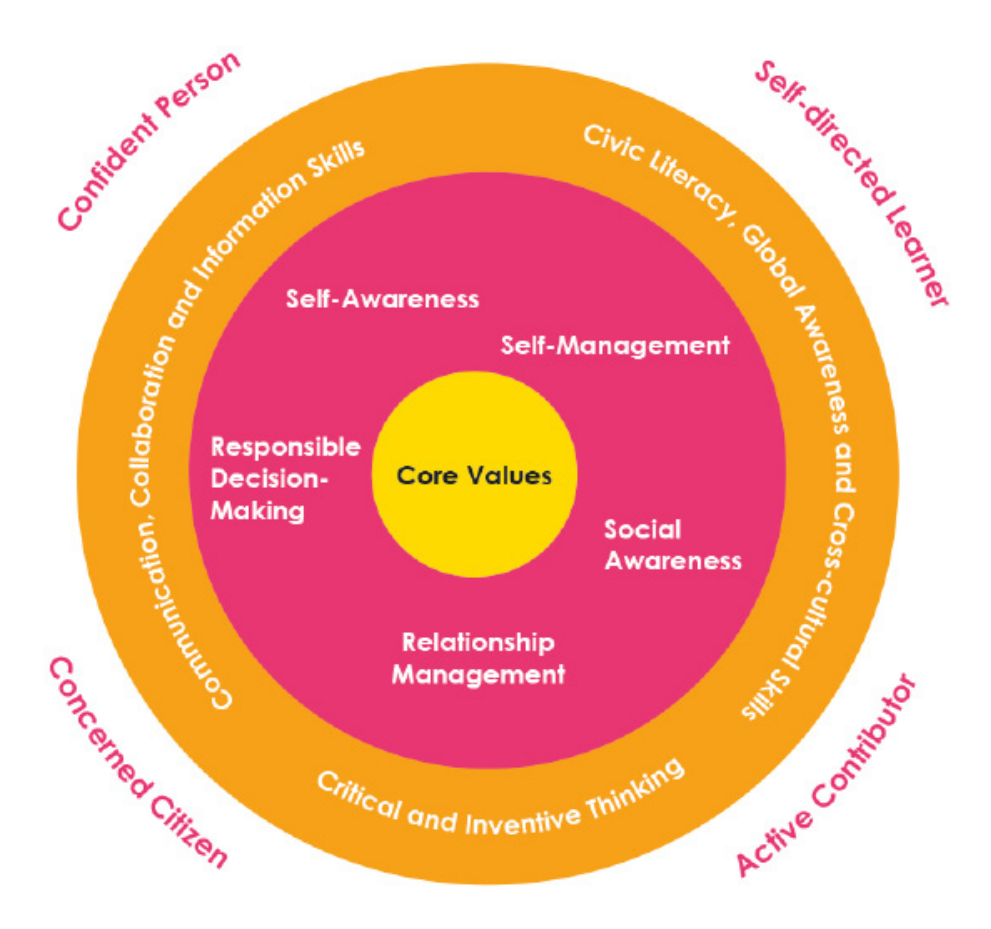
Figure 2: Framework for 21st Century Competencies and Student Outcomes<sup>1</sup> (from 2014 onwards)

In the same vein, the CSE curriculum supports Character and Citizenship Education (CCE) through the development of skills related to citizenship competencies as articulated in the components of the domain of civic literacy, global awareness and cross-cultural skills. The CSE curriculum serves as a platform for students to attain the CCE learning outcomes, which involve learning concepts such as governance that can also be applied to the study of other countries. In addition, discussions about China's development as well as its external relations allow students to reflect on and engage with issues at the community, national and global levels as informed and responsible citizens.