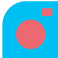
PHOTO & VIDEO CONTEST 2023