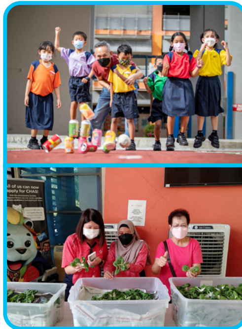
Our School Community