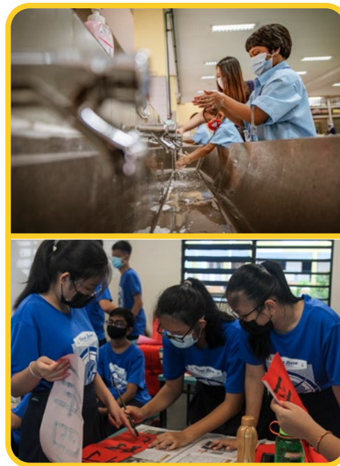
United as One