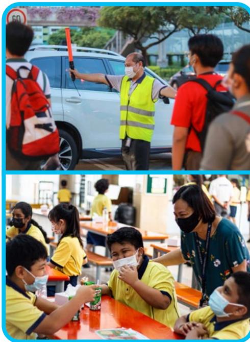
Our School Community