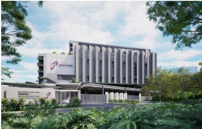
Artist impressions of façade of Jurong Pioneer JC's rejuvenated campus.