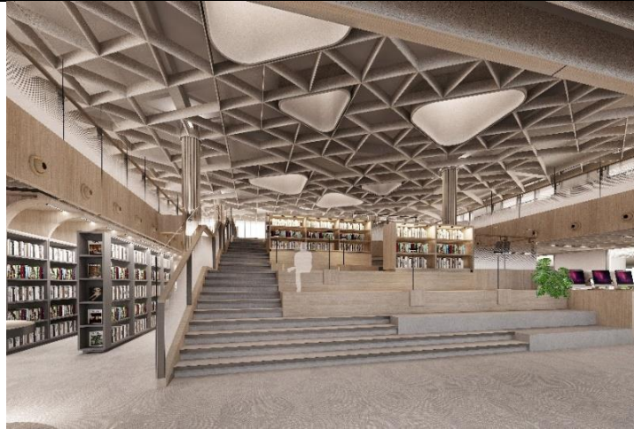
Artist impression of Library in Jurong Pioneer JC's rejuvenated campus.