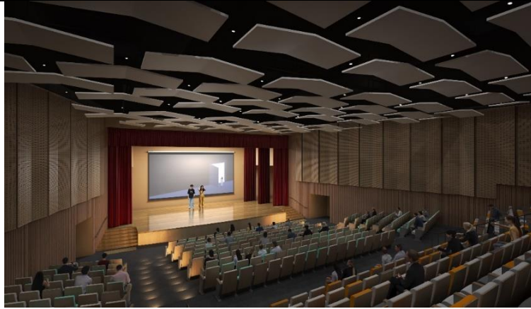
Artist impression of Lecture Theatre in Anderson Serangoon JC's rejuvenated campus.