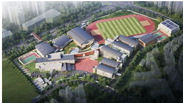
Artist impressions of façade of Yishun Innova JC's rejuvenated campus.