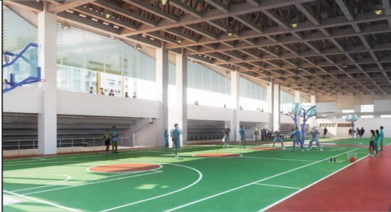
Artist impression of Covered Basketball Court in Temasek JC's rejuvenated campus.