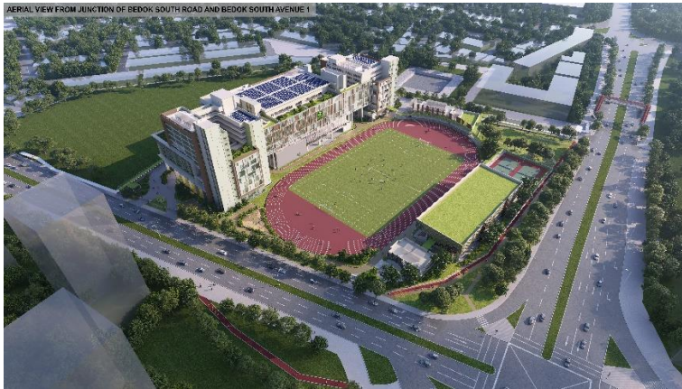
Artist impressions of façade of Temasek JC's rejuvenated campus.