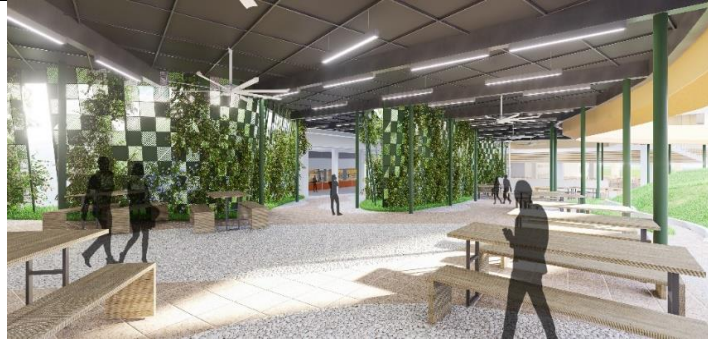
Artist impression of Learning Spine in Yishun Innova JC's rejuvenated campus.