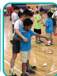
Children from MOE Kindergarten @ Frontier enjoyed making paper craft during PAL and tried out CCAs such as softball and badminton.