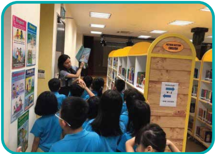
The MK children explored ways to find the books they liked from the various fiction and non-fiction book sections.

They were given opportunities to visit the school bookshop, read books at the library and participate in many other activities. They also enjoyed a fun game of Bingo together with their primary school buddies while experiencing what the larger learning space of a typical primary school classroom was like. The children were delighted to learn that there were libraries in all primary schools and they would be able to borrow books that they loved to read. While visiting the school library, they learnt how to find their favourite books in different sections, and experience the process of borrowing and returning library books. At the end of their primary school visit, the children reflected on their day and drew pictures with simple sentences written to show what they had observed and/or experienced.