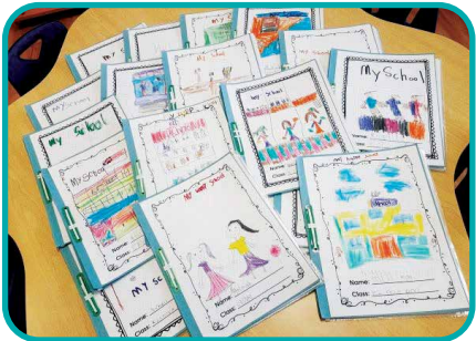
The children created journals on their learning experience in Sengkang Green Primary School.