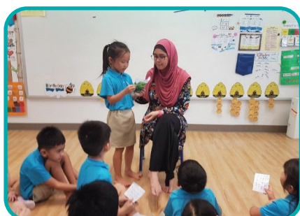
The children took turns to ask questions to find out what life in a primary school is like from a teacher of Frontier Primary School.

At MOE Kindergarten @ Sengkang Green, the children had opportunities to interact with primary school teachers and visit the school canteen to experience recess for themselves. It was a day of exploration for the K2 children as they ventured beyond the kindergarten setting into the familiar yet larger primary school compound.