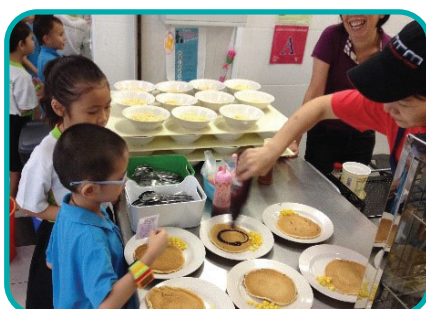
The children learnt to buy food with the guidance of their primary school buddies in Sengkang Green Primary School's canteen.