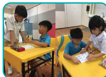
The K2 children played Bingo with their P1 buddies.