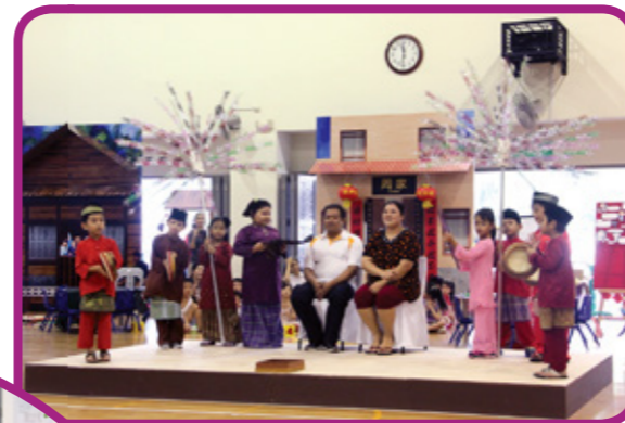
It Takes a Kampung to Raise a Child- Celebrations for the children and families of MK@Blangah Rise, MK@Dazhong and MK@Farrer Park