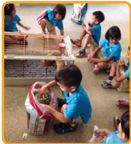
Children filling up the cage with hay

In addition to working together to set up the cage for Dewdrop and Inuka, the children also took turns to care for the guinea pigs on different days of the week. Their duties included washing and filling the food bowl, changing the water in the water bottle, adding hay and providing banana leaves and carrots for the guinea pigs.