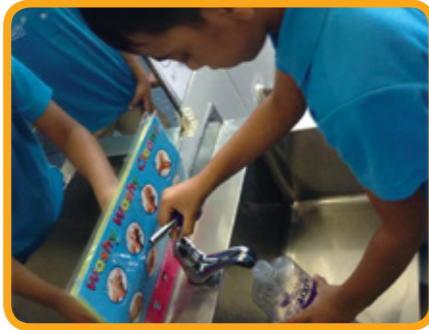
Changing the water in the water bottle