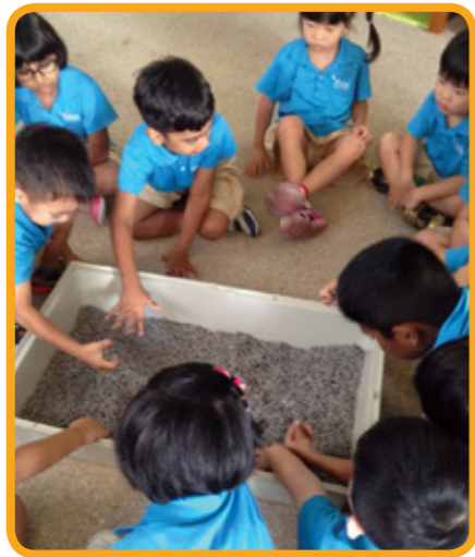
Children feeling the texture of the bedding for the guinea pigs

These were some of the questions the children of K1 Coriander posed during their WoW project in Term 4-All About Guinea Pigs. In this project, the children adopted two guinea pigs, Dewdrop and Inuka, as their class pets.