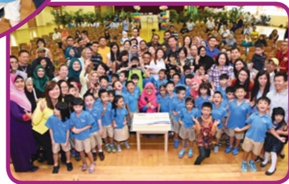
Together, We Celebrate!- Celebration for the children and families of MK@Tampines