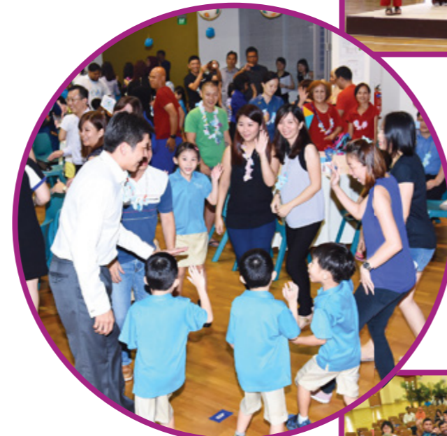
Celebrating The Singapore Child-Acting Minister (Schools) Mr Ng Chee Meng joining children, teachers and families in a Jibidi dance during the celebrations at MK@Punggol View

2015 was a significant year as we saw the first cohort of children complete their Mo E Kindergarten learning experience. We have seen children grow into confident individuals with a love for learning. Children also learned about values like care and respect for others. We are truly grateful to have celebrated this milestone with the children and their families.