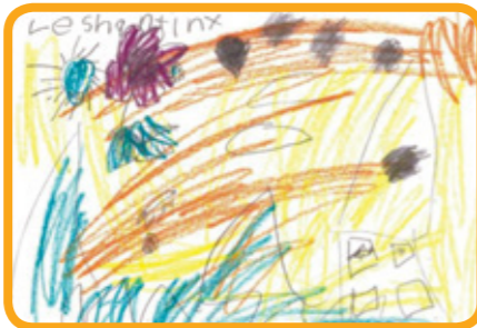
Leshantiny's documentation of the field trip to the neighbourhood pet shop

Working in pairs, they also took turns to look out for the guinea pigs when taking them on outdoor walks.