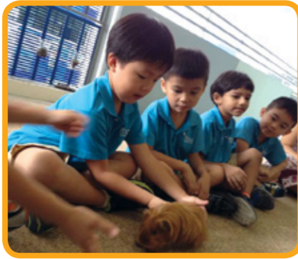
Children getting to know the guinea pigs

Through the project, the children developed patience when holding the guinea pigs, learning to release them if the guinea pigs struggled too much.