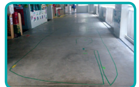
Outline of the sperm whale

Through this project, children had opportunities to play and learn how to interact with their peers.