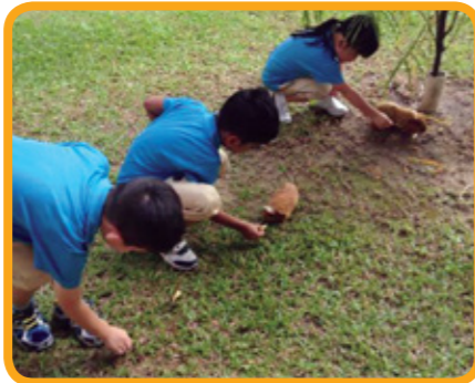
Taking the guinea pigs out for a walk

Through the project, the children developed patience when holding the guinea pigs, learning to release them if the guinea pigs struggled too much.