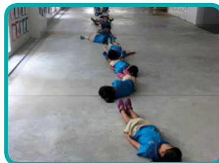
Children using their bodies to measure the length of a sperm whale

Learning becomes fun when children are given the freedom to explore the things around them and the space to exercise their creativity. The children later came up with a creative “Sperm Whale Game”, complete with its own rules: