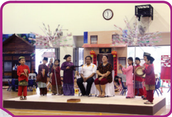
It Takes a Kampung to Raise a Child- Celebrations for the children and families of MK@Blangah Rise, MK@Dazhong and MK@Farrer Park