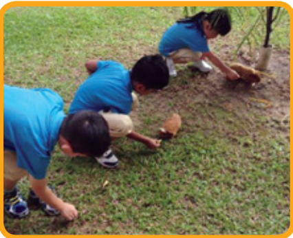
Taking the guinea pigs out for a walk

Through the project, the children developed patience when holding the guinea pigs, learning to release them if the guinea pigs struggled too much.