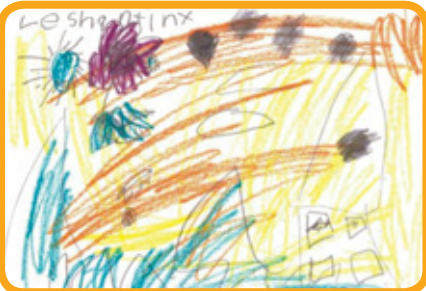
Leshantiny's documentation of the field trip to the neighbourhood pet shop

Working in pairs, they also took turns to look out for the guinea pigs when taking them on outdoor walks.