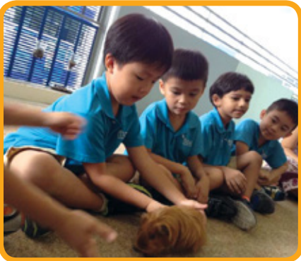
Children getting to know the guinea pigs

Through the project, the children developed patience when holding the guinea pigs, learning to release them if the guinea pigs struggled too much.