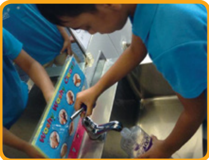
Changing the water in the water bottle