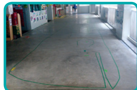
Outline of the sperm whale

Through this project, children had opportunities to play and learn how to interact with their peers.