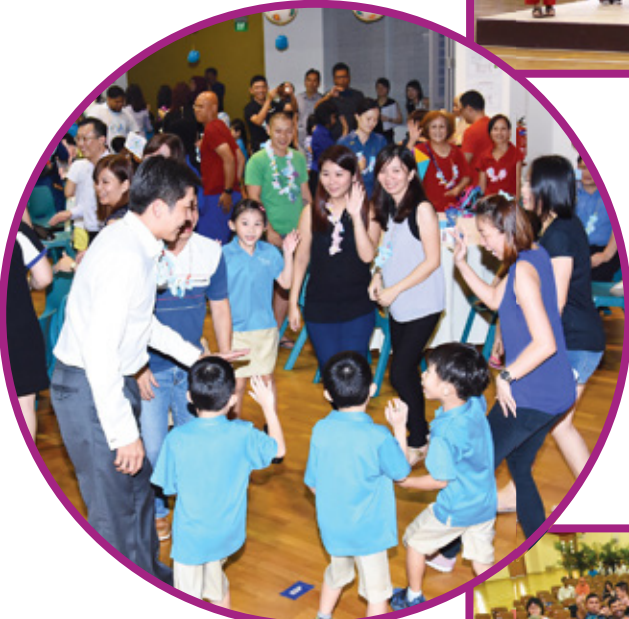
Celebrating The Singapore Child-Acting Minister (Schools) Mr Ng Chee Meng joining children, teachers and families in a Jibidi dance during the celebrations at MK@Punggol View

2015 was a significant year as we saw the first cohort of children complete their Mo E Kindergarten learning experience. We have seen children grow into confident individuals with a love for learning. Children also learned about values like care and respect for others. We are truly grateful to have celebrated this milestone with the children and their families.