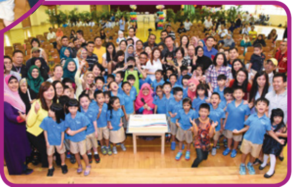
Together, We Celebrate!- Celebration for the children and families of MK@Tampines