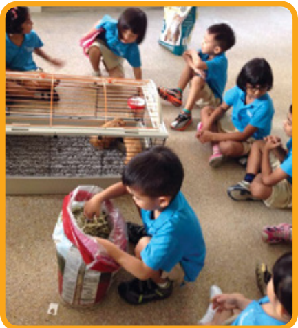
Children filling up the cage with hay

In addition to working together to set up the cage for Dewdrop and Inuka, the children also took turns to care for the guinea pigs on different days of the week. Their duties included washing and filling the food bowl, changing the water in the water bottle, adding hay and providing banana leaves and carrots for the guinea pigs.