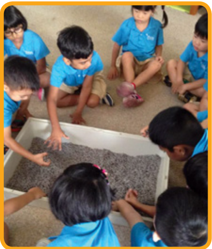
Children feeling the texture of the bedding for the guinea pigs

These were some of the questions the children of K1 Coriander posed during their WoW project in Term 4-All About Guinea Pigs. In this project, the children adopted two guinea pigs, Dewdrop and Inuka, as their class pets.